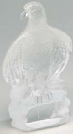
#1001 $150 00 (P)