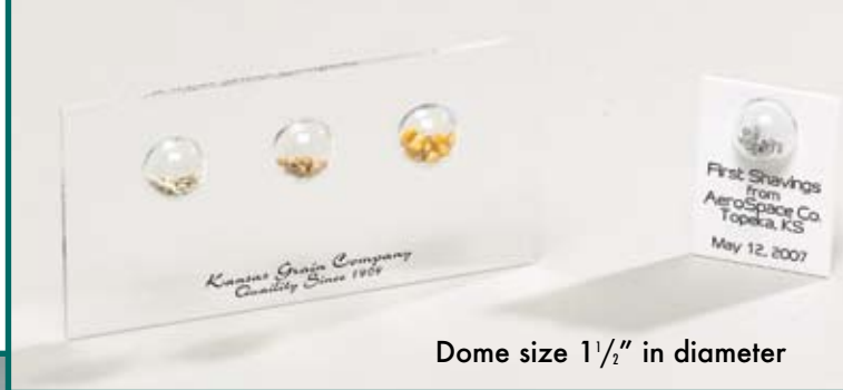
Dome size 1 1/2" in diameter