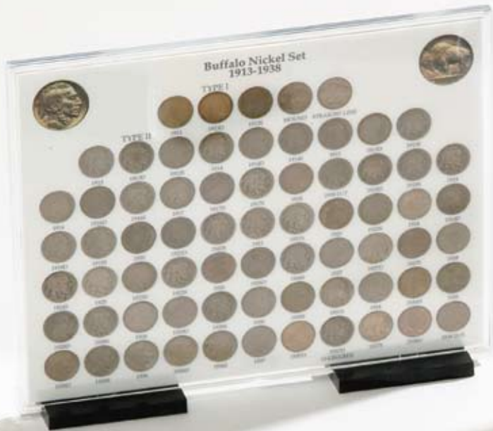
Coin Holding Snap Plaque