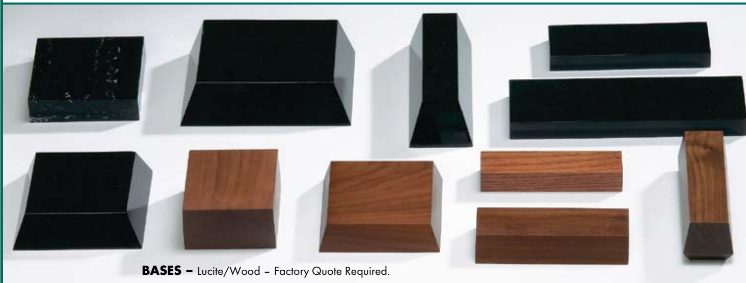
BASES – Lucite/Wood – Factory Quote Required.