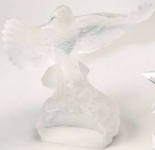
#1003 $165 00 (P)