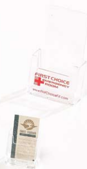
Vertical Card Holder

Pocket holders include 1 color screened imprint. Parts are shipped poly-bagged and bulk packed. Orders less than minimum require factory quote.