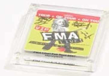
Post and Screw

Certificate Holders - 2 pieces of sheet acrylic pinned together to hold thin inserts that are not suitable for embedment. Sets are shipped bulk, unassembled. Other sizes available, prices shown are unimprinted. Assembly $0.30(T) (5P)