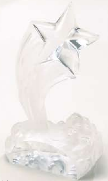
#2002 $150 00 (P)