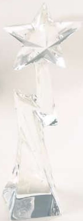
#2001 $150 00 (P)