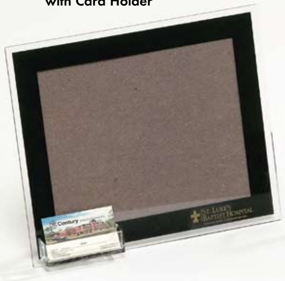
Flat Acrylic Frame Plaques with Card Holder