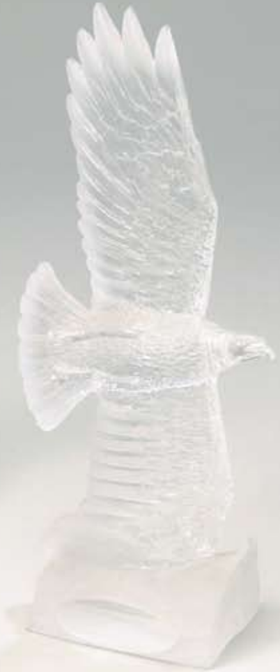
#1002 $165 00 (P)