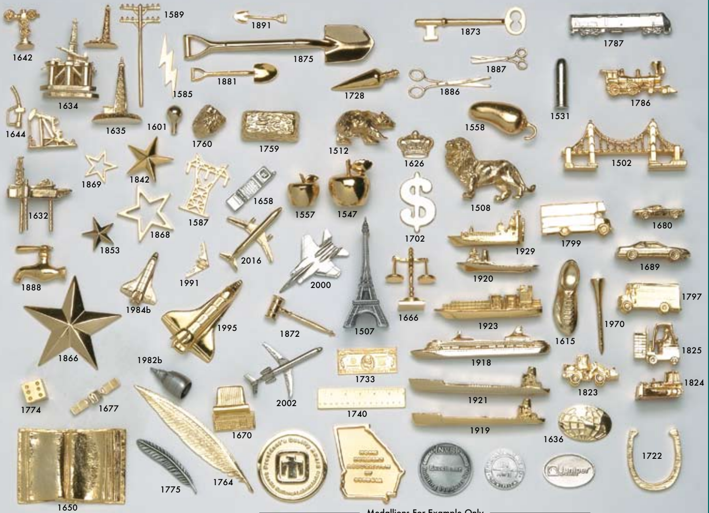
Medallions For Example Only.