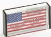
Business Card Weight