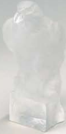
#1004 $150 00 (P)